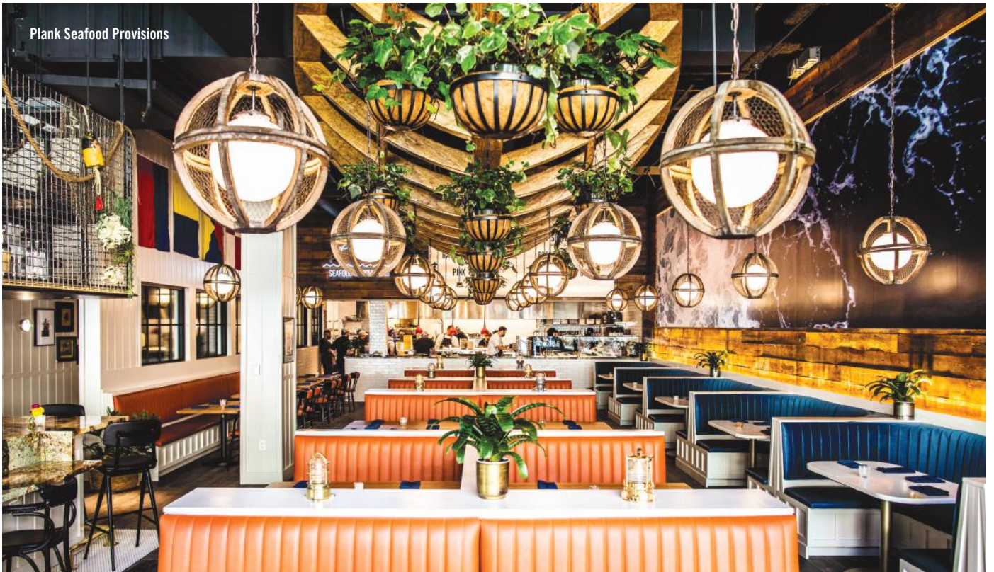
Plank Seafood Provisions