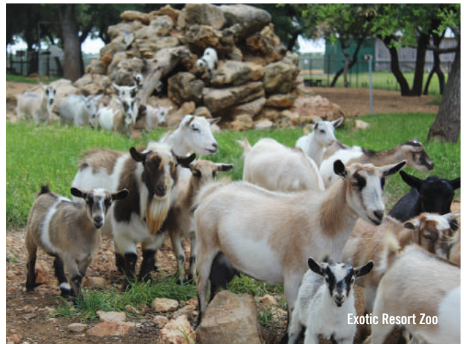
Exotic Resort Zoo

With all there is to see and do in Johnson City, you may feel like spending the night. Lighthouse Hill Ranch offers visitors a unique getaway. With an assortment of suites and ranch homes, this picturesque property has over 2,000 acres to explore. And yes, you can stay in the 86-foot-tall lighthouse, which itself is situated atop a 200-foot hill. Needless to say, you'll get some amazing views of the Hill Country if you stay there, in addition to access to the property's trails, lakes, pools and fishing ponds.