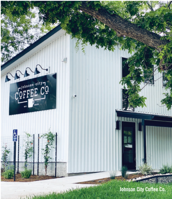
Johnson City Coffee Co.