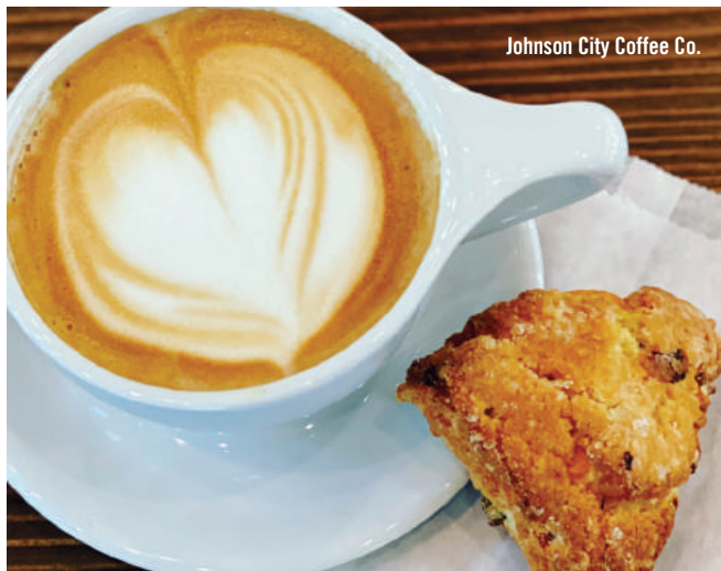
Johnson City Coffee Co.