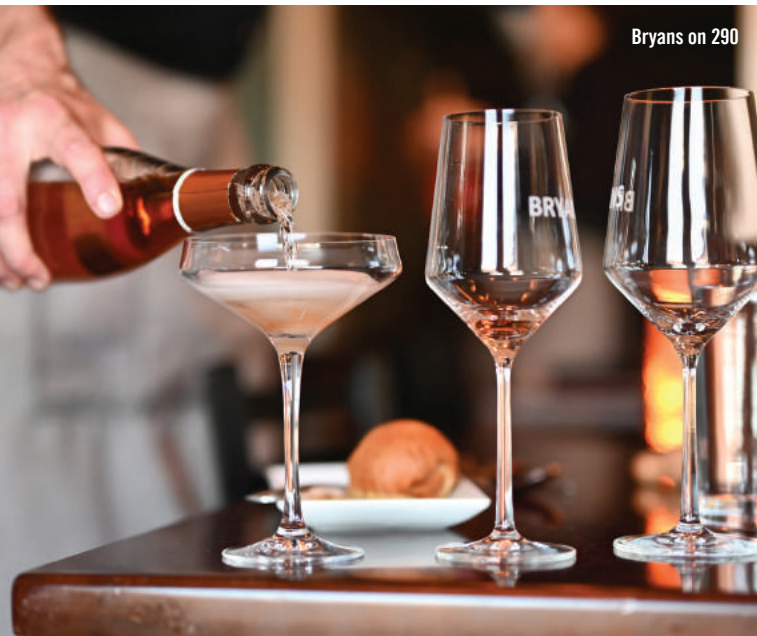
Bryans on 290