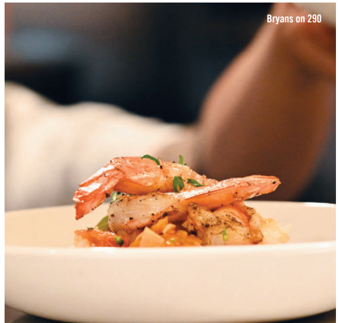
Bryans on 290