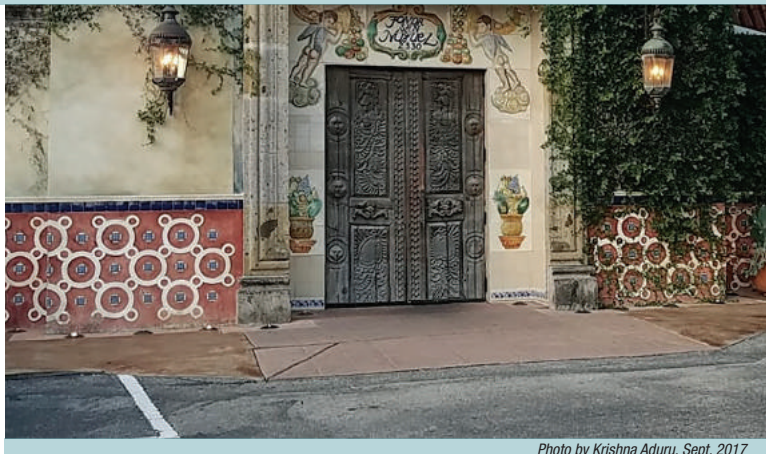
Sept. 2017

By 1975, the surgeons of Austin Oral Surgery had established their own brand of full-service surgical care for their patients. Now, our 12 convenient locations staffed by board-certified oral surgery specialists continue to innovate and expand services to meet the needs of Austin and the surrounding area. Our legacy is exceptional care.