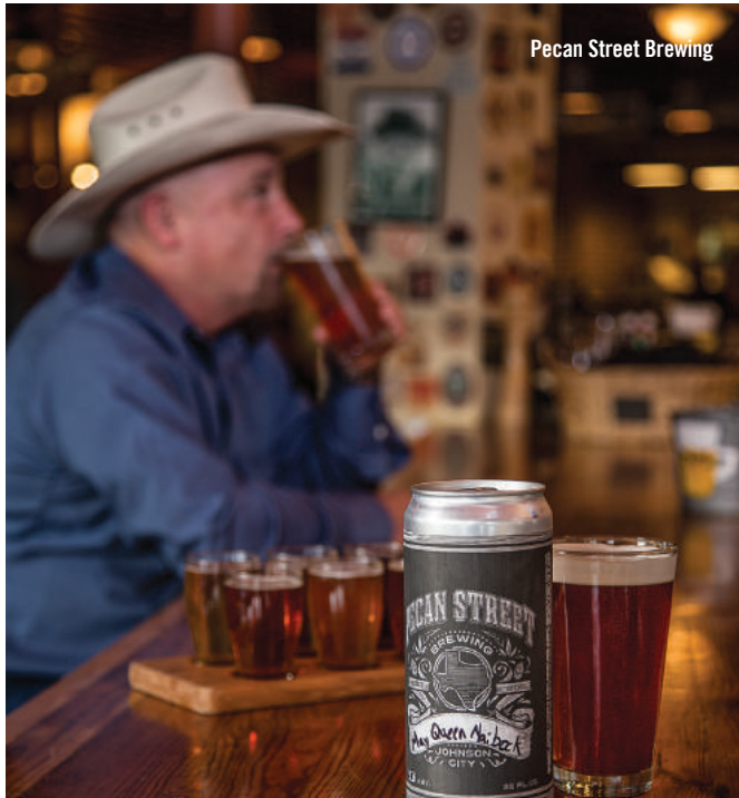
Pecan Street Brewing