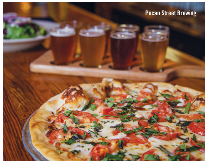
Pecan Street Brewing