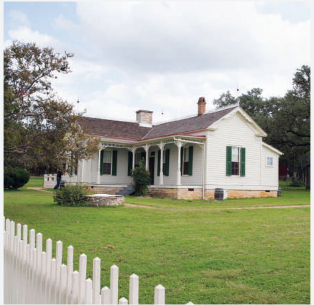
Lyndon B. Johnson boyhood home

Exotic animals in Johnson City? It's true! At the Exotic Resort Zoo, you can take a guided tour through the expansive property; home to more than 600 animals, including camels, bison, zebras and ostriches.